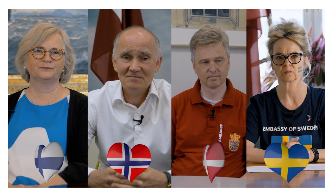
Enjoy our video about the Nordics during the Hockey season. Thank you to the Nordic Embassies!